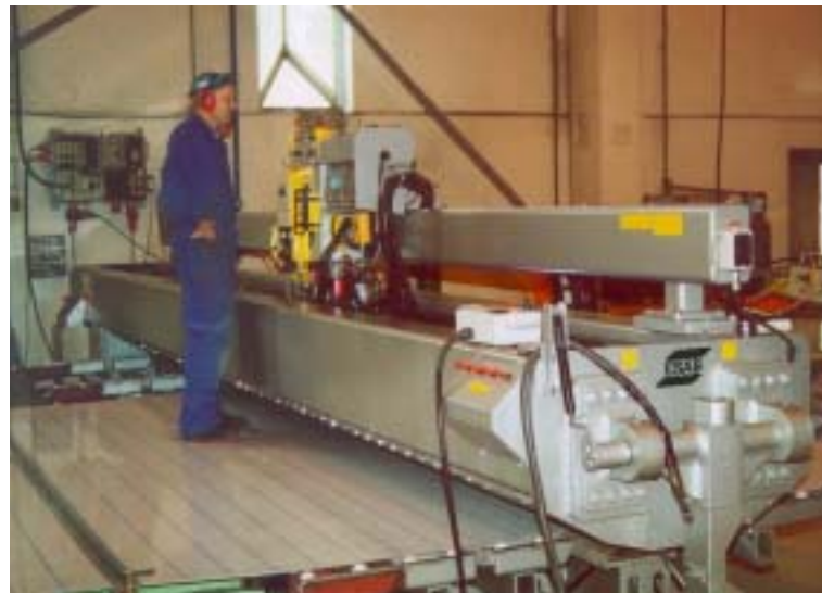
ID60H10 Seamer with remote control and in- and out-feeding conveyor